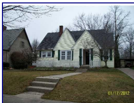
916 W AUGLAIZE