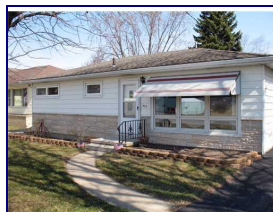
422 S PINE STREET