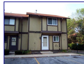
21 GREENTREE CIRCLE