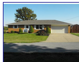
14870 FOX RANCH