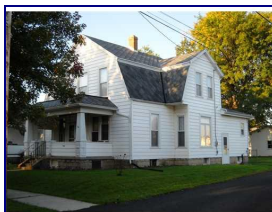
407 S COURT STREET