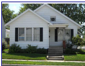
901 E BENTON STREET