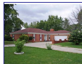
902 CARNATION DRIVE