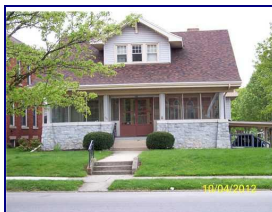
201 S BLACKHOOF