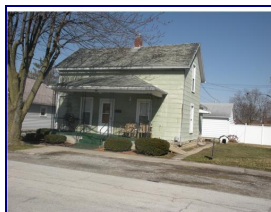
106 W PLUM