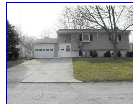
123 N WAGNER