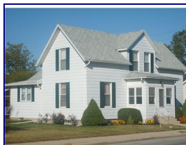
808 MIDDLE STREET