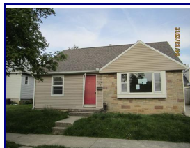
404 S PERRY