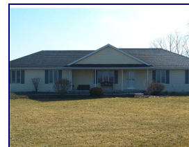
15502 BIGLER ROAD