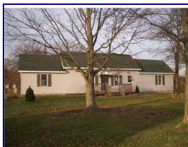
17587 BUCKLAND HOLDEN