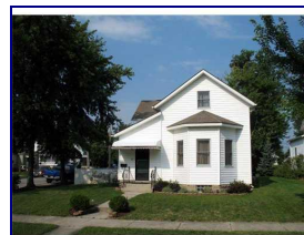
411 S COURT STREET