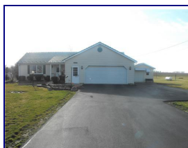
17671 GOLDEN BRIDGE