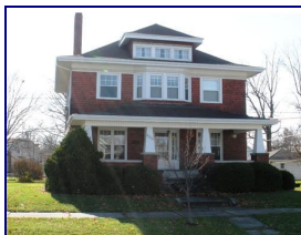
605 W PEARL STREET