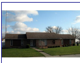
112 N WAGNER STREET