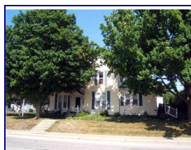
301 E MECHANIC