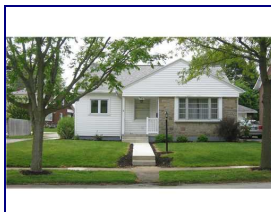
709 W AUGLAIZE