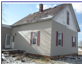
19440 SR 67